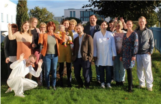
Allresist team - and how we will welcome you on 26.8.