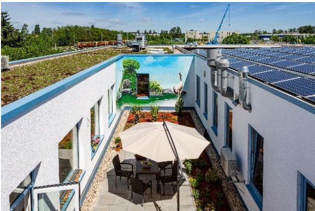
Roof-top view on the photovoltaic system, green roof and atrium - a triad of climate protection, nature conservation and place for employees to take a break