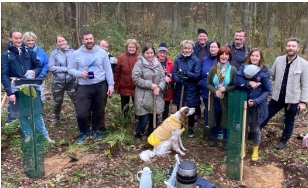
Joint planting of young trees in the AR team in Gottesgabe (Oderbruch), even the dog participates enthusiastically.