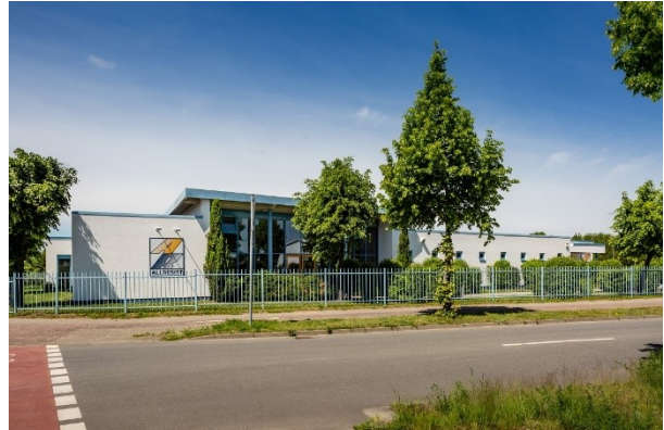
Allresist company building after the second extension in 2018